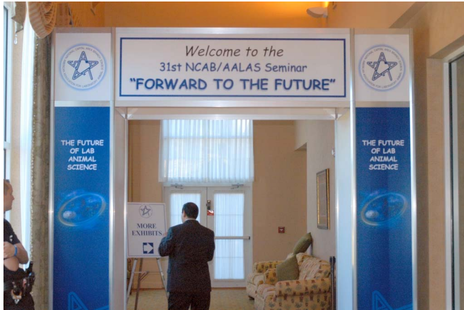
Welcome to All!